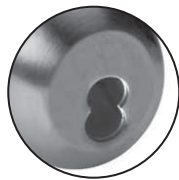
SFIC model available